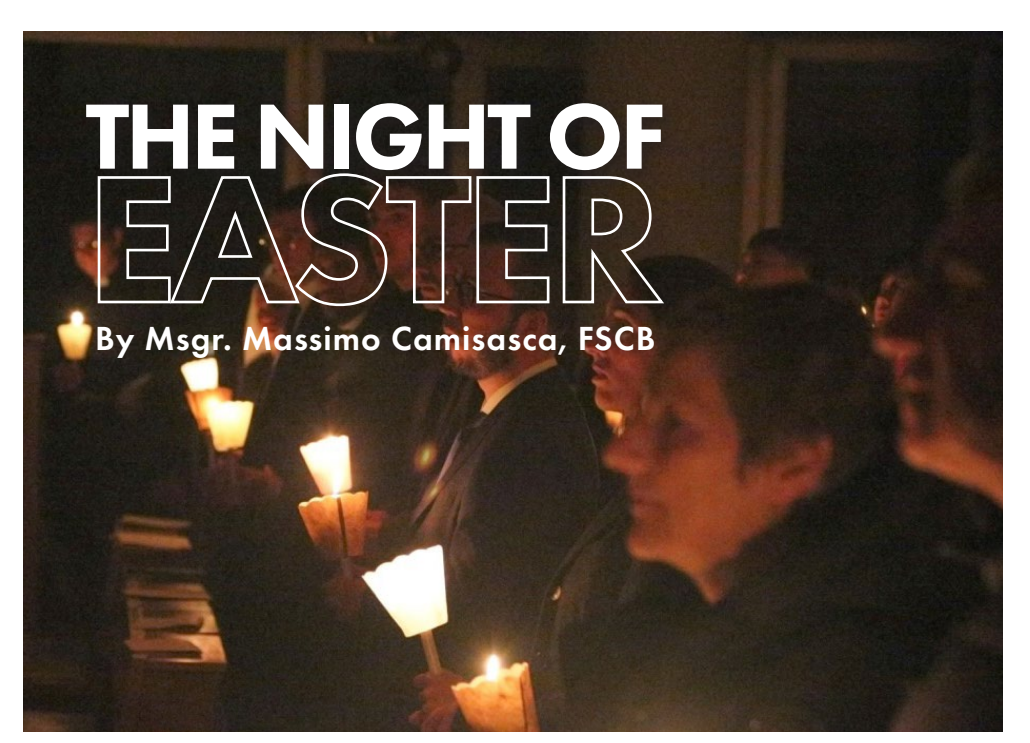
Photo: A moment from the Easter Vigil liturgy in the House of Formation of the Fraternity of St. Charles

he liturgy of the night of Easter is the most ancient in the Church: born in the synagogue, it then slowly developed until it took on, in the VII century, its current form. We can live it according to its two registers: word and sign. If we listen to the texts that are proclaimed or prayer, a pedagogy of words helps us to enter into the unity of the history of salvation and therefore of our own personal history. But the Church also educates us through a "pedagogy of signs."