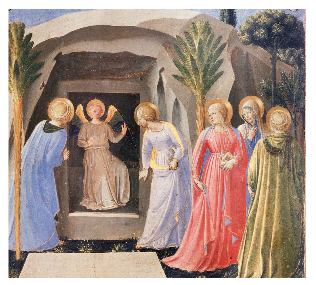
Blessed Fra Angelico, The Three Marys at the Tomb , tempera on wood panel, 1450–1453, detail, Museo Nazionale di San Marco, Florence, Italy

he night is drawing to a close and the first light of dawn is appearing upon the horizon as the women set out toward Jesus' tomb. They make their way forward, bewildered and dismayed, their hearts overwhelmed with grief at the death that took away their Beloved. Yet upon arriving and seeing the empty tomb, they turn around and retrace their steps. They leave the tomb behind and run to the disciples to proclaim a change of course: Jesus is risen and awaits them in Galilee. In their lives, those women experienced Easter as a Pasch, a passage. They pass from walking sorrowfully towards the tomb to running back with joy to the disciples to tell them not only that the Lord is risen, but also that they are to set out immediately to reach a destination, Galilee. There they will meet the Risen Lord. The rebirth of the disciples, the resurrection of their hearts, passes through Galilee. Let us enter into this journey of the disciples from the tomb to Galilee.