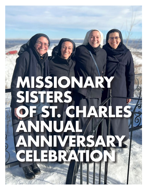
SATURDAY, APRIL 6, 2024 6:30–8:30 PM NATIVITY CABRINI HALL