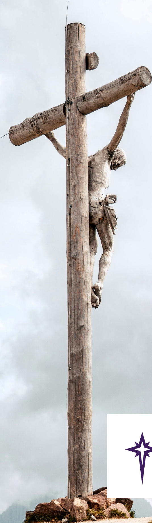
Crucifix in the Dolomites, Italy

FOR GOD SO LOVED THE WORLD THAT HE GAVE HIS ONLY SON, SO THAT EVERYONE WHO BELIEVES IN HIM MIGHT NOT PERISH BUT MIGHT HAVE ETERNAL LIFE.