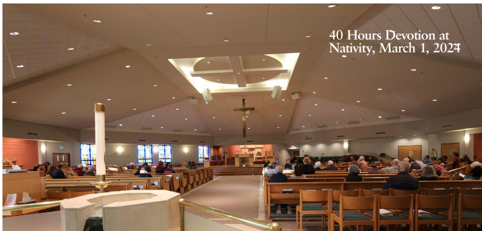
40 Hours Devotion at Nativity, March 1, 2024