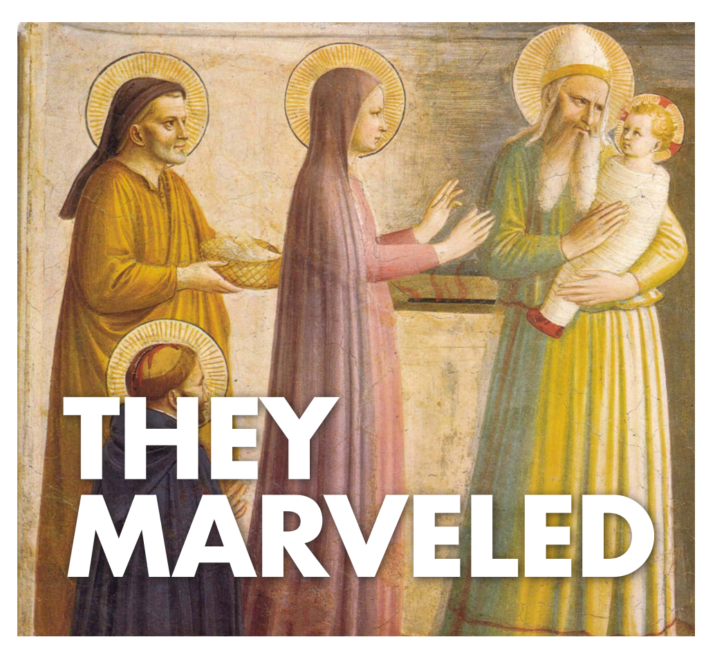
FEAST OF THE HOLY FAMILY OF JESUS, MARY AND JOSEPH POPE FRANCIS | ANGELUS | SAINT PETER'S SQUARE SUNDAY, DEC 31, 2023