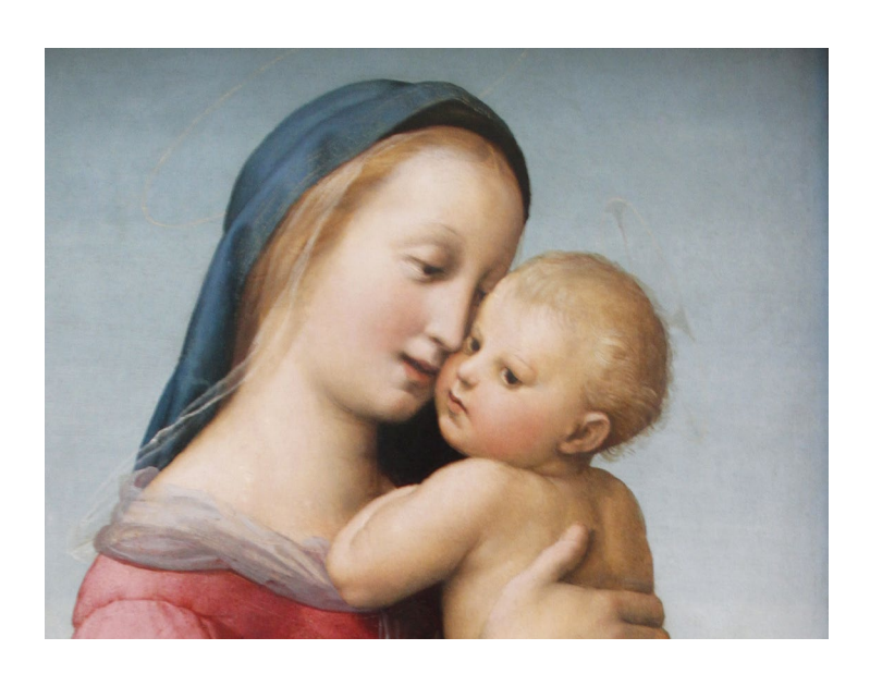
Raffaello Sanzio, Tempi Madonna , oil on poplar panel, 1508; Alte Pinakothek - Munich - Germany, Bavarian State Painting Collections; US PD

SOURCE: www.sancarlo.org/en/conobbe-solo-bene