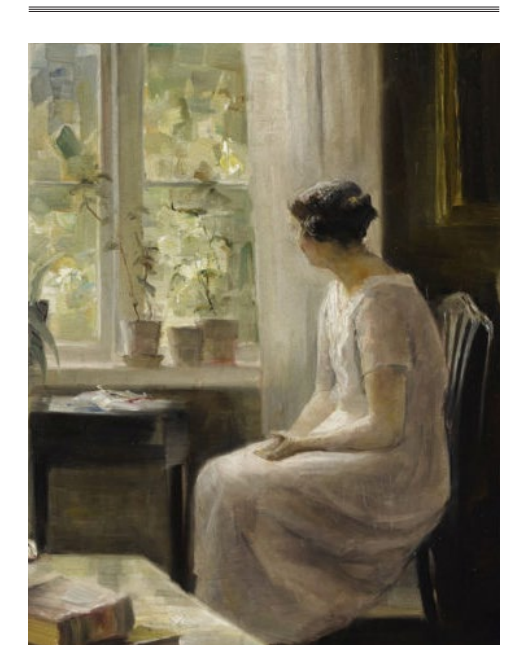
Carl Holsøe, Light of Spring (Detail).