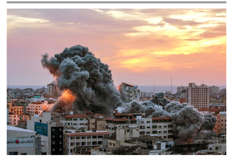
Gaza, October 7, 2023