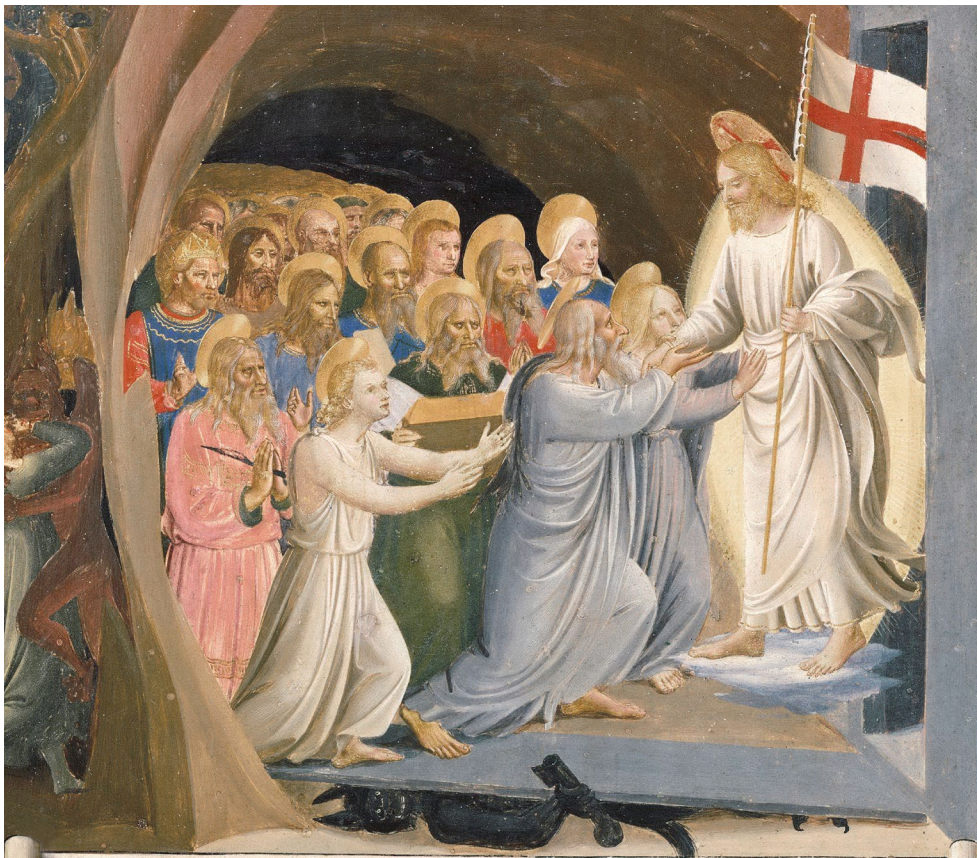
Art: Blessed Fra Angelico, Descent into Underworld , from the Armadio degli Argenti Painting Series, tempera on wood panel, ca. 1450, Museo di San Marco, Florence, Italy; USPD