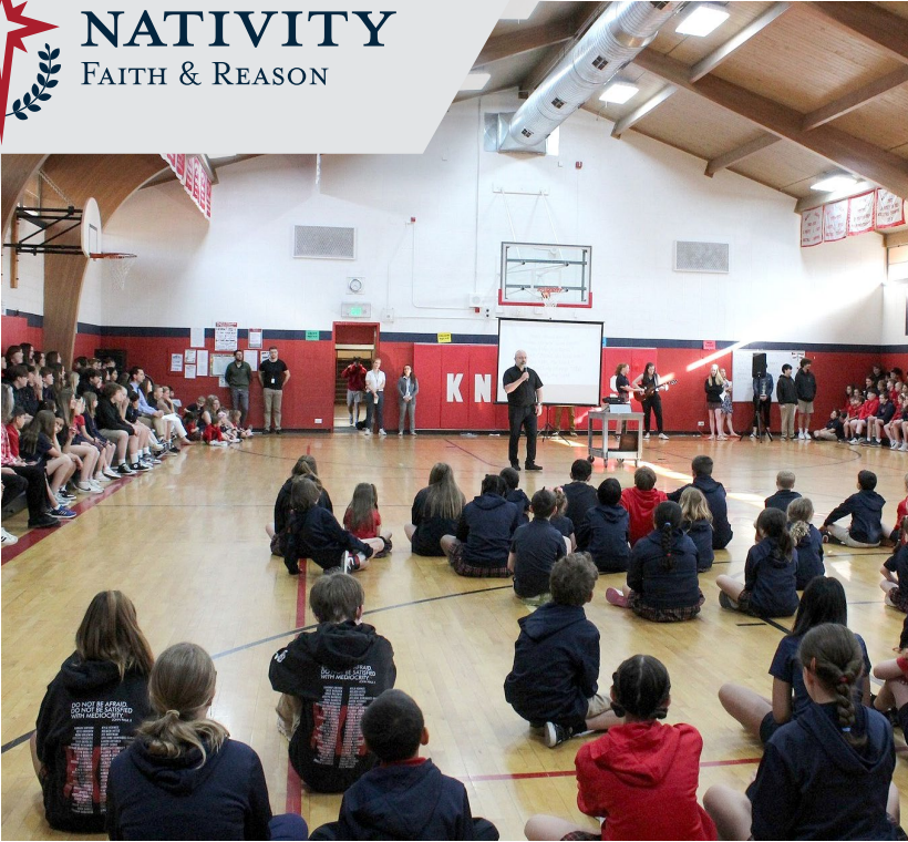
Monday Assembly Lesson: The TRUTH of the Resurrection! The students sang "Peter Do You Love Me" and learned about the Shroud of Turin.