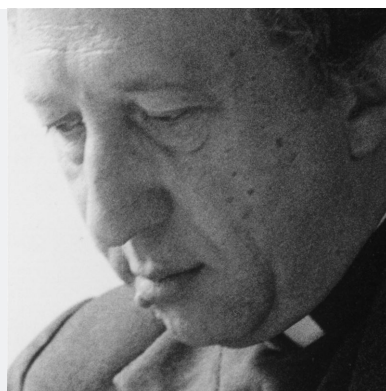
Fr. Luigi Giussani, 1922-2005

We will accompany the moment of prayer in the Basilica of Sant'Ambrogio that will mark the beginning of this new phase with affectionate and lively participation, placing the irrepressible desire we carry in our hearts to soon see Father Giussani counted among the blessed and saints of the Lord in the hands of the Church.