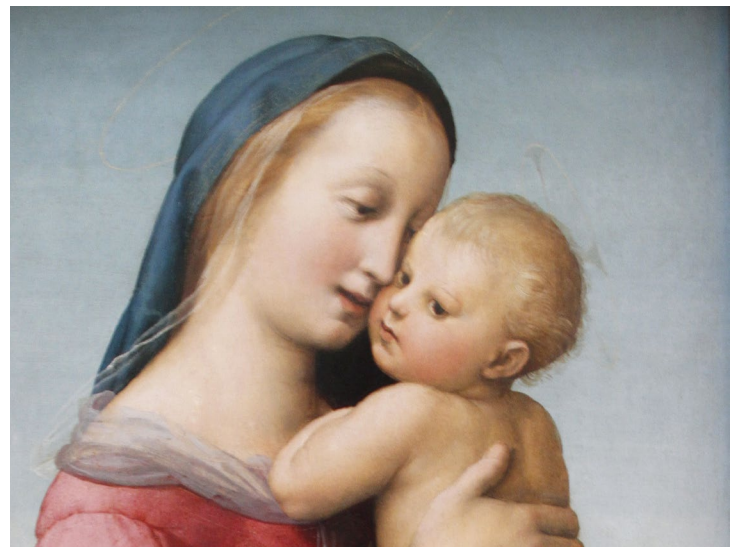
Raffaello Sanzio, Tempi Madonna , oil on poplar panel, 1508; Alte Pinakothek - Munich - Germany, Bavarian State Painting Collections; US PD

God wants us to be inhabited by Christ, filled with Him. Only in this way can we truly be who we are, as He wanted us and originally thought of us, looking towards the day in which He will be “all in all.”