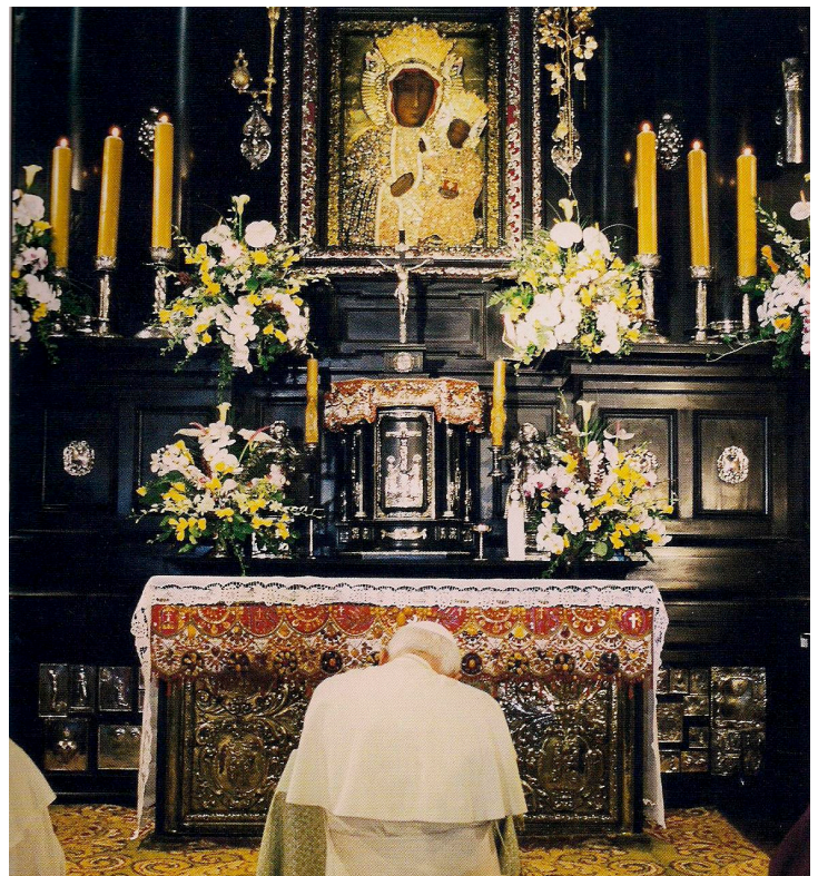
Photo: John Paul II at the Shrine of Our Lady of Czestochowa, 1979

[...] As she goes forward with the whole of humanity towards the frontier between the two Millennia, the Church, for her part, with the whole community of believers and in union with all men and women of good will, takes up the great challenge contained in these words of the Marian antiphon: "the people who have fallen yet strive to rise again," and she addresses both the Redeemer and his Mother with the plea: "Assist us." For, as this prayer attests, the Church sees the Blessed Mother of God in the saving mystery of Christ and in her own mystery. She sees Mary deeply rooted in humanity's history, in man's eternal vocation according to the providential plan which God has made for him from eternity. She sees Mary maternally present and sharing in the many complicated problems which today beset the lives of individuals, families and nations; she sees her helping the Christian people in the constant struggle between good and evil, to ensure that it "does not fall," or, if it has fallen, that it "rises again."